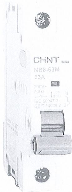
Images of NB8-63M

Signed for and on behalf of Zhejiang CHINT Electric Co., Ltd.