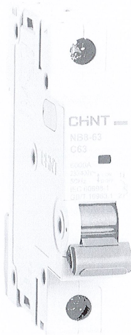
Images of NB8-63