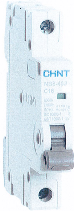
Images of NB8-40J