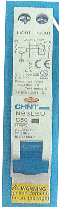
Images of NB3LEU

Signed for and on behalf of Zhejiang CHINT Electric Co., Ltd. — Chint Industrial Zone, January 04, 2022