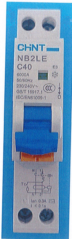
Images of NB2LE