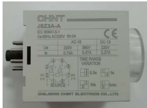
Images of JSZ3